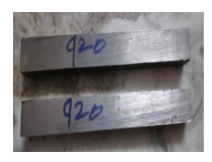
FIGURE 2. Specimen with austenizing process

The tool steel specimens of dimensions length 200mmhaving rectangular cross section of size 20x15 mm2 have been used in this study. Four tool steel specimens have been used in this study. Specimen 1 has been directly used for cryo-soaking for a period of 15 hrs. Specimen 2 was initially soaked in the cryogenics for a period of 15 hrs and then it was tempered at 150oC for 1 hr. Specimens 3 and 4 were first kept for austenizing at 850°C for duration of 30mins. After the austenizing process both specimens were suddenly quenched in water. Specimen 3 was left for cryogenic treatment for duration of 5 hrs. After removing from the cryogenic treatment, the specimen was tempered at 200oC for a duration of 1 hr. Specimen 4 was soaked in the cryogenic for a duration of 25 hrs, After the cryogenic treatment, it was tempered at 200°C for a period of 1 hr.