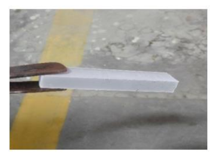
FIGURE 6. Keeping specimen in cryocan