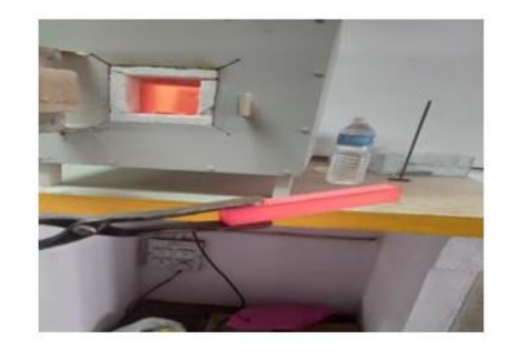
FIGURE 4. Specimen with austenizing Process