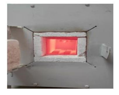
FIGURE 3. Austenizing (850°C)