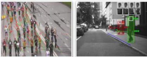
Fig. 3. Movement velocity prophecy is actually important for efficient applications like visual surveillance and self-driving vehicles.

patterns of a passerby is actually vital. A big physical body of job learns activity designs through clustering trajectories. Nevertheless, projecting the potential movement trail of a person is actually truly demanding as the forecast can not be predicted in isolation. In a congested atmosphere, human beings conform their motion according to the actions of neighboring folks. They may quit, or change their roads to fit other individuals or the environment in the vicinity. Collectively modeling such intricate reliances is actually really complicated in vibrant environments. Additionally, the anticipated velocities need to certainly not only be actually appropriate but likewise socially acceptable. Passerby always appreciates private space while walking, and thus produce right of way. Human-human and human-object communications are actually normally skillful and sophisticated in packed atmospheres, creating the concern a lot more demanding. In addition, there are various future predictions in a packed environment, which are actually all socially appropriate. Therefore anxiety evaluation for the multimodal predictions is actually wanted. Forecasting velocity, as well as place by understanding bodily scene, was explored in which was just one of the introducing operate in trajectory prediction in the computer dream neighborhood. The recommended approach models the result of the physical setting on the selection of human actions.