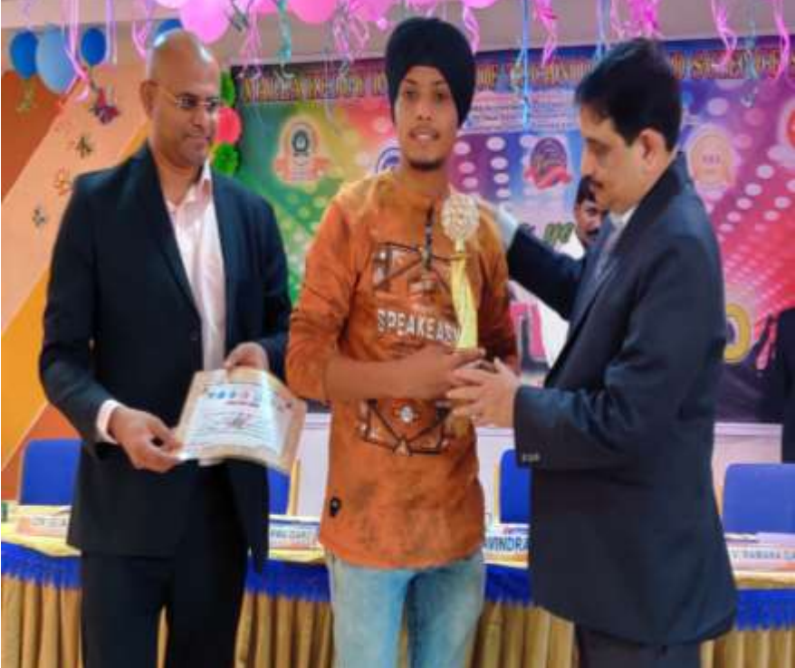
Department of Information Technology